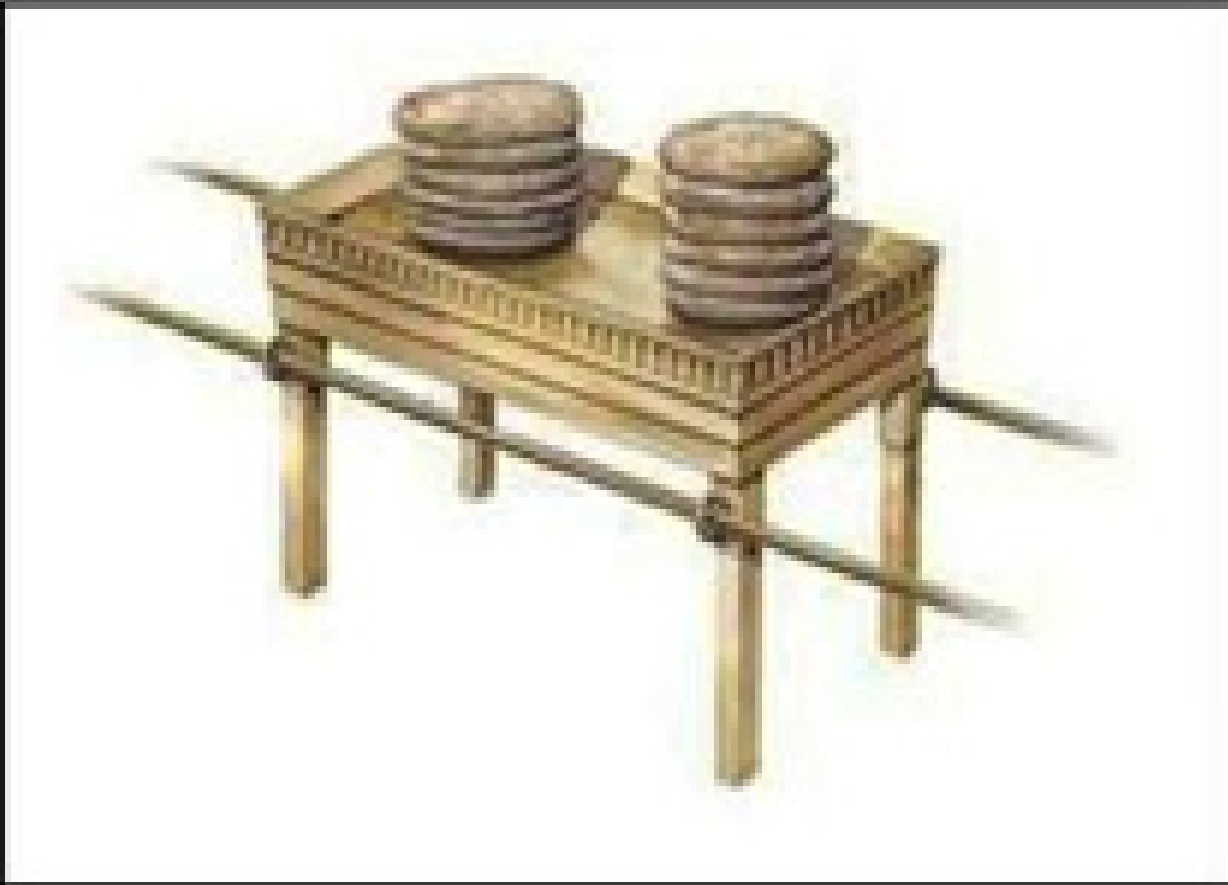
TABLE OF SHOWBREAD