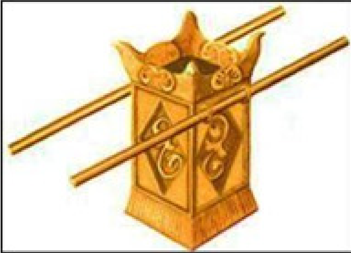
ALTAR OF INCENSE